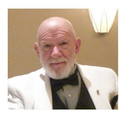
From the Supreme Secretary's Desk